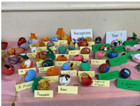
A selection of entries